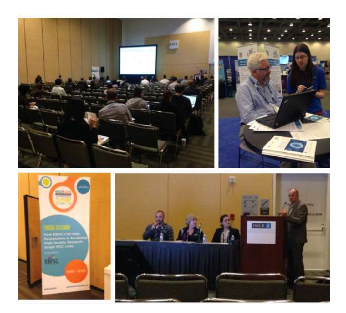
Figure 4: EBiSC participation in the ISSCR Annual Meeting 2016 in San Francisco / USA (22-25 June 2016)

The resource has also been promoted at relevant scientific conferences either as a dedicated EBiSC exhibit or as prominent part of the DH-CC offering and included in its marketing activities e.g. newsletters, brochures and digital marketing e.g. through Twitter and ResearchGate.