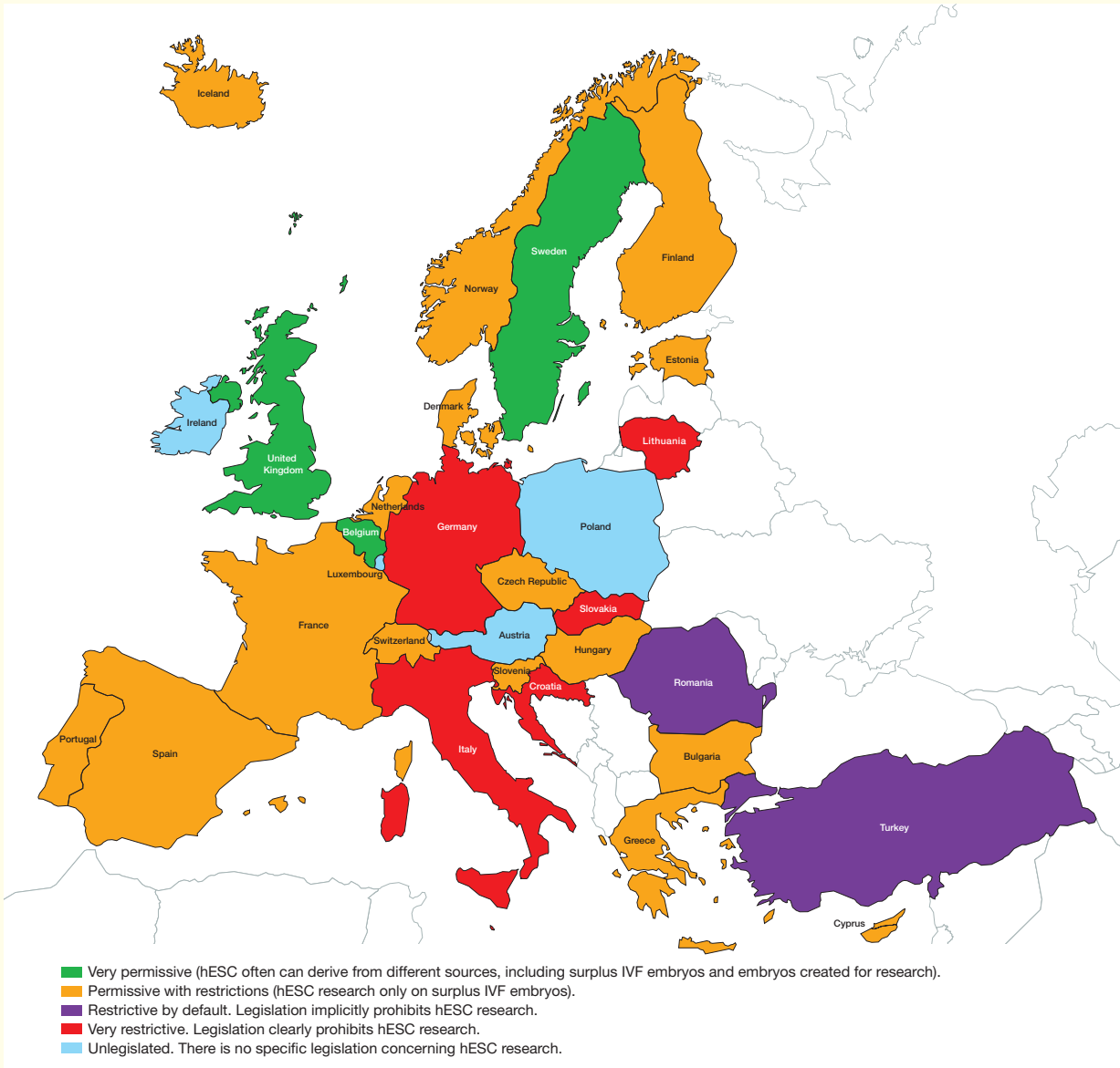
Figure 1. National positions on human embryonic stem cell research policy and regulatory framework in Europe.

collaborations and innovation in Europe. It seems reasonable to infer that continued support of stem cell research will yield more data and enable future advances that will help clarify the safest and most suitable indication for each type of stem cell therapy.